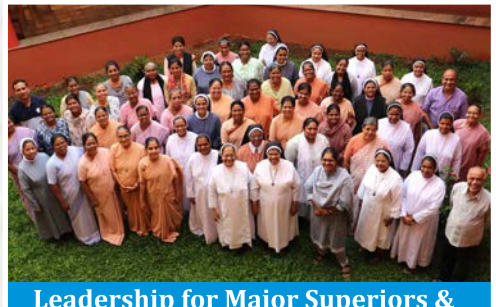
Leadership for Major Superiors & Team: Sept 2023