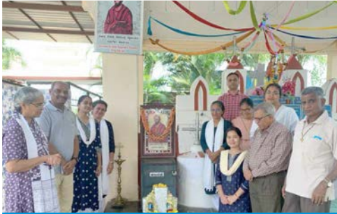
Mini-Sabbatical Programme: Nov-Dec 2023