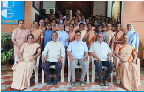
Leadership for Superiors: June 2023