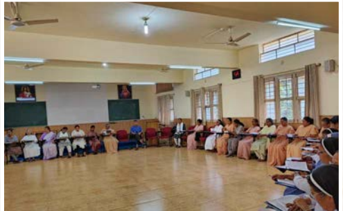
Major Superiors & Team: Sharing