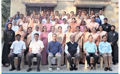
Final Profession: Jan-March 2024