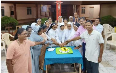
Silver Jubilee Celebrations