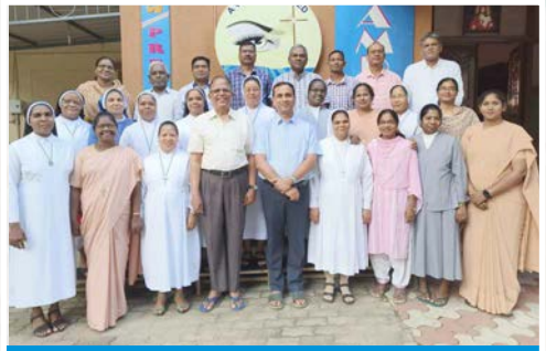
Silver Jubilarians: Oct 2023