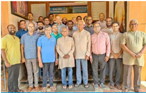
Retreat for Jesuits: May 2023