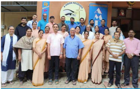
Leadership for Teachers: August 2023