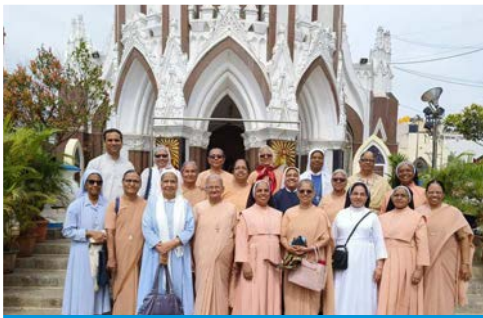
Golden Jubilarians: Sept 2023