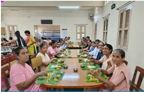
Monthi-Fest: 8 Sept 2023