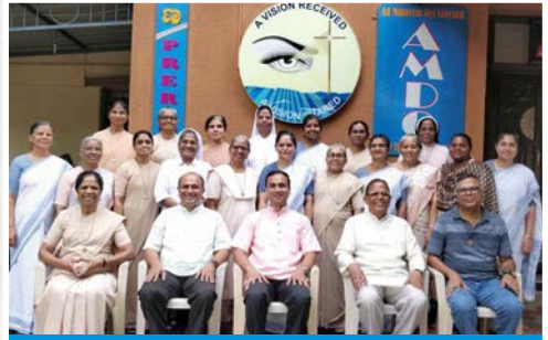
Leadership for Superiors: April 2023