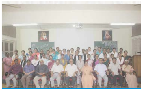
Graduation Day: 7 March 2024