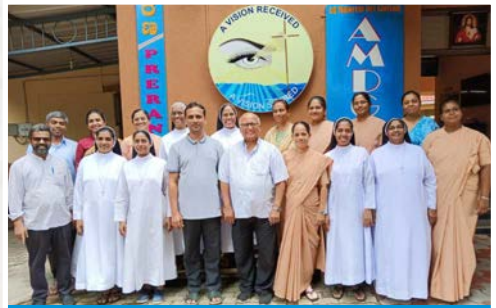
Leadership for Teachers: July 2023