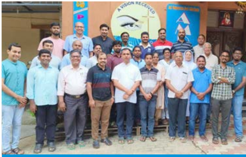
Retreat Direction: April-May 2023