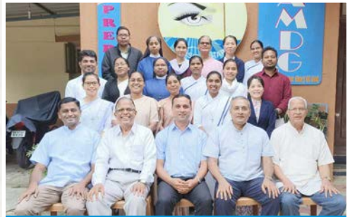
Final Profession: June-Aug 2023