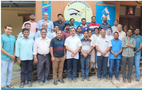
Retreat Direction: April-May 2023