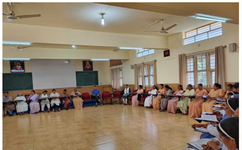
Major Superiors & Team: Sharing