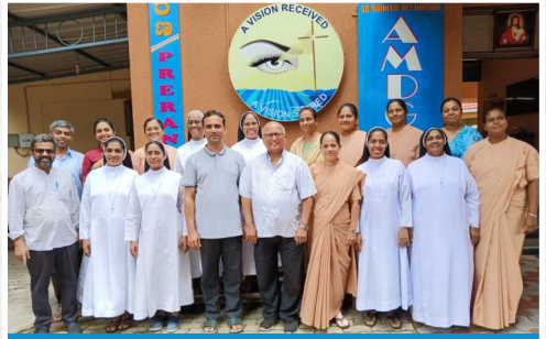
Leadership for Teachers: July 2023