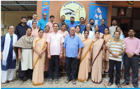
Leadership for Teachers: August 2023