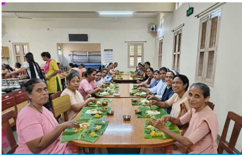
Monthi-Fest: 8 Sept 2023