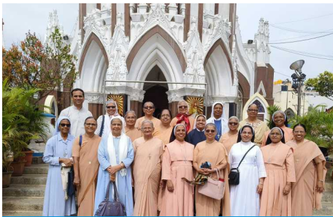
Golden Jubilarians: Sept 2023