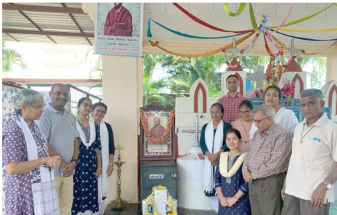
Mini-Sabbatical Programme: Nov-Dec 2023