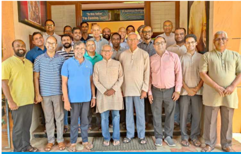
Retreat for Jesuits: May 2023