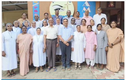
Silver Jubilarians: Oct 2023