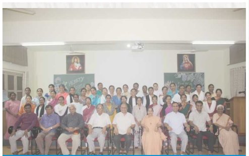
Graduation Day: 7 March 2024