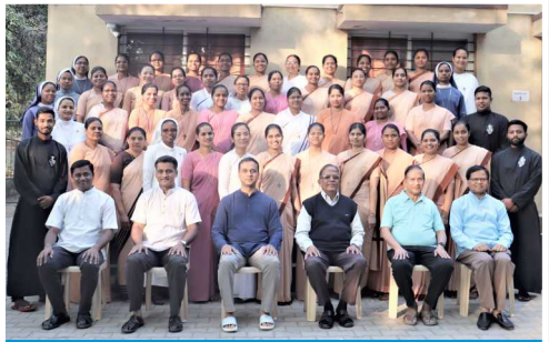
Final Profession: Jan-March 2024