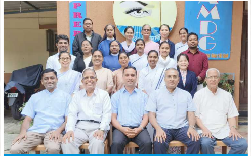
Final Profession: June-Aug 2023