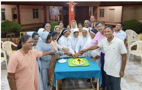
Silver Jubilee Celebrations