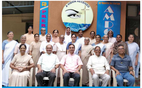
Leadership for Superiors: April 2023