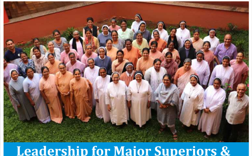
Leadership for Major Superiors & Team: Sept 2023