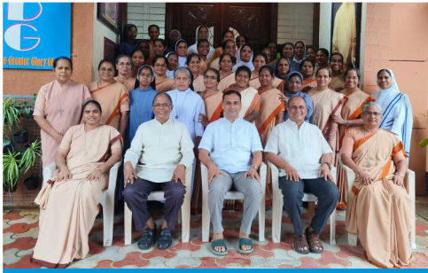
Leadership for Superiors: June 2023